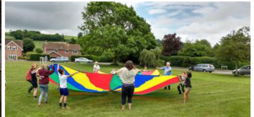
(Clockwise from left) Referee supervises 'match of the day'; parachute games; the tea party; the band tune up in readiness for guests.