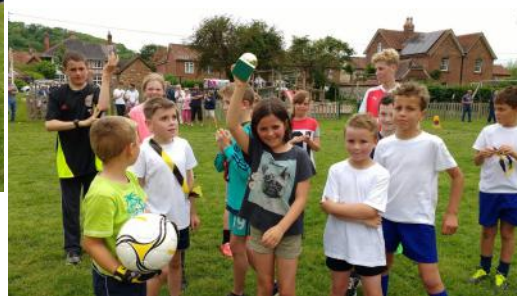
Two star football teams, not in the least worn out after their challenging match! (Left)

from end to end, no-one could say they left the table without the feeling of having indulged in some special treats.