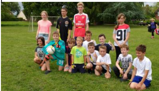
The winning team with trophy held high! (Right)