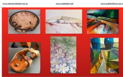
Shaftesbury Arts Centre 13 Bell Street SP7 8BG Thursday 10th - Tuesday 22nd September 2015 Daily 10 - 4